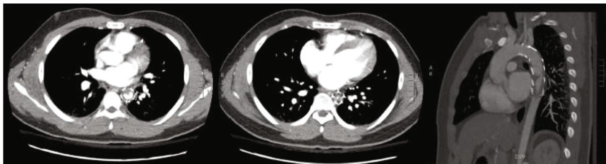
FIGURE 1: CT scan revealing an endovascular thoracic aortic stent graft spanning the distal arch through the mid descending thoracic aorta. Beginning at the distal third of the stent is circumferential low-attenuation centrally progressing to near complete occlusion at the terminal portion of the stent. Near occlusion at the approximate level of the T7 and T8 intervertebral disc. The superior portion of the thrombus demonstrates a triangular morphology. Small renal infarcts are also noted, seen in the sagittal plane.

Neurology, Cardiothoracic Surgery, and Interventional Radiology were consulted. In view of the imaging findings and the clinical presentation, the running hypothesis was hypoperfusion and acute cord ischemia. Given the absence of cord changes on the MRI, the precise level of potential vascular compromise to the cord was unknown. Lack of cord changes on MRI is presumed to be due to prompt imaging before ischemic injury was detected.