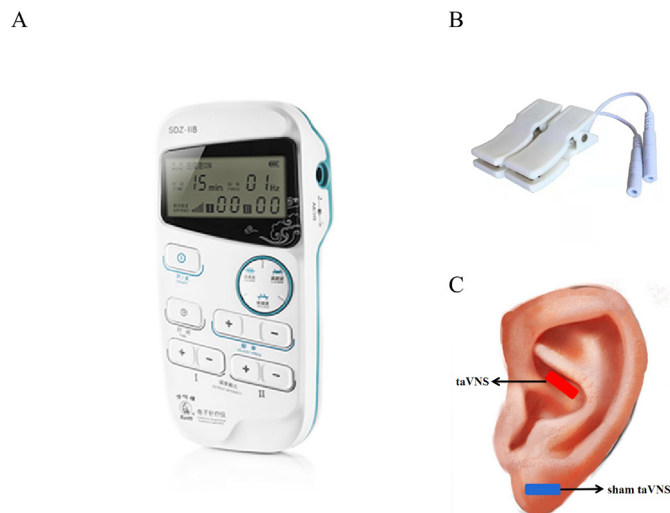
Figure 2 (A) Stimulation device (SDZIIb, Huatuo). (B) Ear clip electrodes. (C) TAVNS (cymba conchae) and sham (earlobe) stimulation locations. TAVNS, transcutaneous auricular vagus nerve stimulation.

Patients, outcome assessors and statistical analysts will remain unaware of patient study allocation. To minimise discussion of the intervention, patients in different groups will not be housed in the same hospital ward. Neither outcome assessors nor statistical analysts will be engaged in intervention administration. Assessors will avoid asking for information about the stimulation location. Group allocation will be coded (A/B) and kept in sealed, opaque envelopes by a specified research assistant. Code identifiers will be unblinded after the completion of all data analyses.