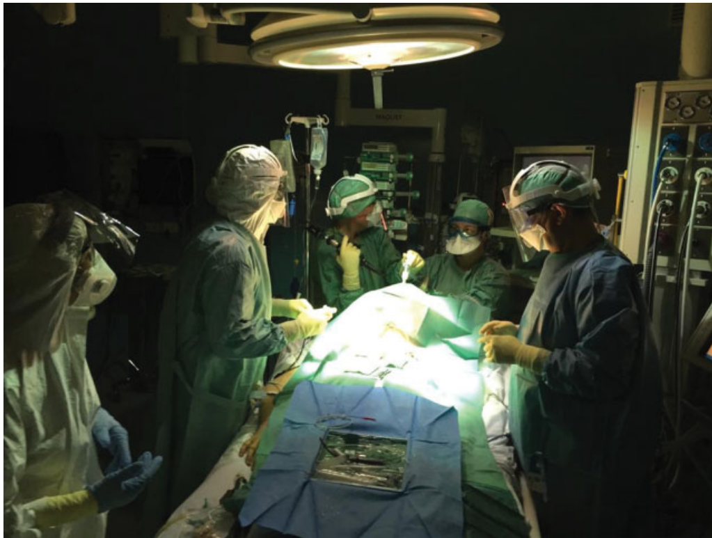
Fig.1 Tracheostomy procedure performed in a COVID-19 patient on veno-venous extracorporeal membrane oxygenation, personnel wearing full PPE.