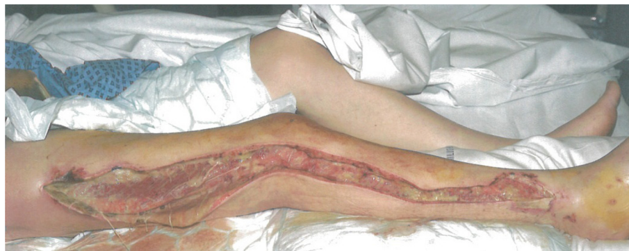
Figure 2 This picture demonstrates the extensive debridement necessary to remove infection from the tracking abscess.

Three weeks after he was discharged from his initial admission he returned for a right hemicolectomy and defunctioning ileostomy, rather than a primary anastomosis given his poor nutritional state and recurrent lower limb wound infections. The histology confirmed