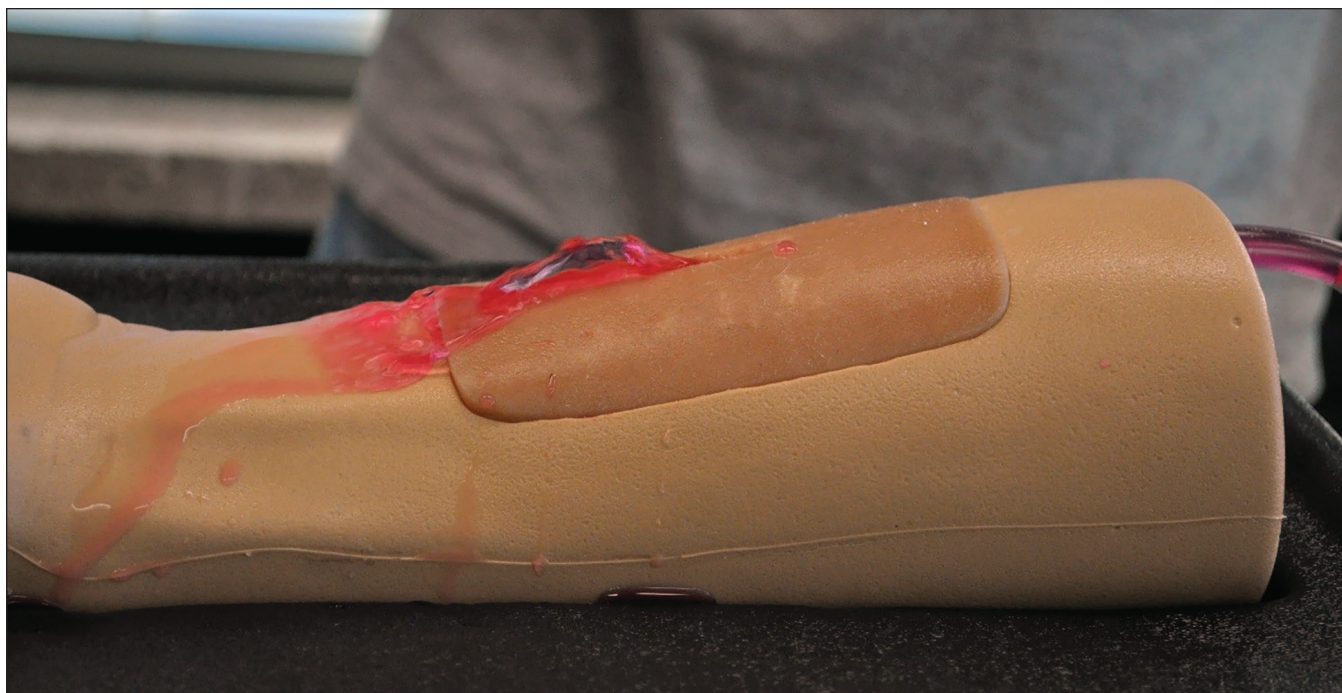
Fig. 1: Sawbones extremity exsanguination simulator (Sawbones 1534 Arm Trainer, Pacific Research Laboratories Inc.).

The effectiveness of the clamp application was assessed through the use of a standardized scoring protocol to assess the effectiveness of clamp application in controlling fluid loss from the wound (Table 2). An attempt was deemed to be unsuccessful if either the wound was completely missed or the iTClamp was applied to the wound but bleeding was not controlled at all. There were no time limitations placed upon the robot operators although time to application was measured as a study variable. There was no penalty for “dropped” wound clamps other than the additional time taken to complete the testing sequence. Repeated applications following any initial application were permitted at the complete discretion of the robot operator. For the discussion of potential operational relevance, zones of potential threat were defined according to Pennardt, with the term “hot zones” describing the area where a direct and immediate threat exists and the term “warm zones” specifically referring to the area where a potential threat exists but where there is no direct or immediate threat. 5