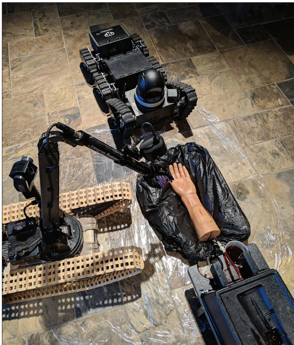
Fig. 2: Overview of the Dragon Runner robot about to apply the wound clamp to the Extremity Exsanguination model with the Vantage Patrol robot observing. The Vantage Patrol robot provided triangulation for increased visualization at a right angle to the Dragon Runner robot.