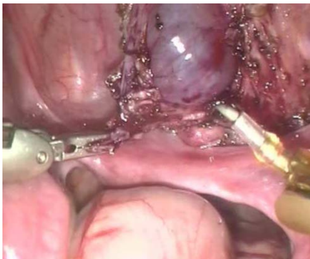
Fig. 2 Extravesical approach: very gently the detrusor muscle is incised and peeled away until the delicate bladder mucosa starts to bulge

In our experience there were no bladder symptoms post surgery in any of the patients. All cases of reflux resolved, but there was one case of “de novo” contralateral low-grade reflux [3]. Later we successfully performed this operation in an adult male patient after a failed subureteral injection (unpublished data). Interestingly, Elmore et al. recently reported on the use of the open Lich-Gregoir technique as salvage in these patients as well [9] and already in 2004 one similar laparoscopic patient was reported by Shu et al. [29]. Both in open and laparoscopic surgery this was a novel approach, meant to avoid the sometimes difficult intravesical dissection due to foreign material after STING. Peters and Borer reported persisting low-grade reflux in 2 of their 24 patients [23].