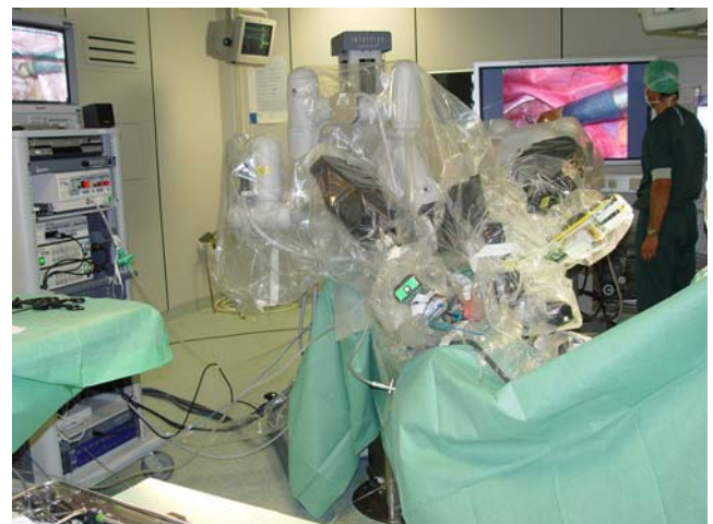
Fig. 1 Outside view once the draped robotic arms are connected to the laparoscopic ports: the child seems completely “embraced” by the machine

To start, a cystoscopic evaluation of the relevant anatomy is carried out. The camera port is then placed in the umbilicus and the two working ports in each lower abdominal quadrant. A small transverse peritoneal incision is made on the laterodorsal side of the bladder where the ureter is retrieved. The ureter is then buried in a trough between the mucosa and detrusor to create the anti-reflux mechanism (Figs. 2 and 3). The bladder catheter is removed already at the end of the procedure unless a significant perforation needing suturing of the mucosa has been made.