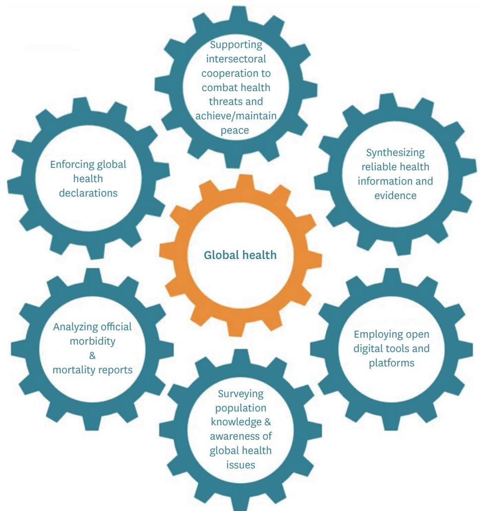
Fig. 2. Continuum of global health strategies.

complicated further by abuses of social media to promote misinformation and manipulate public opinion for non-medical purposes. 81