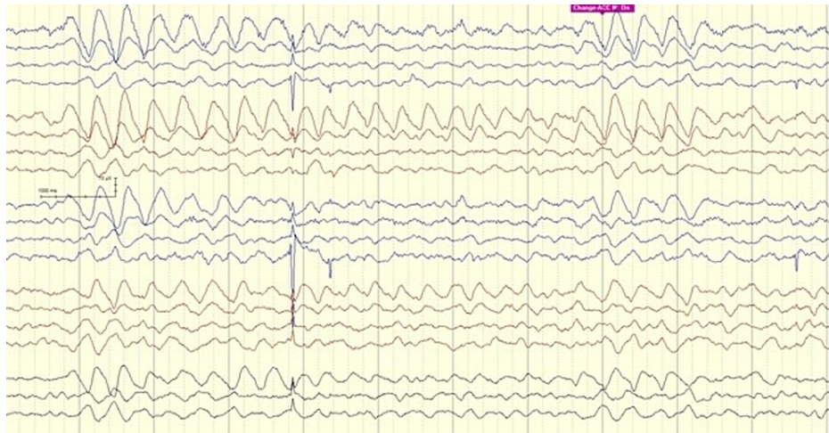
FIGURE 2: EEG showing recurring frontal intermittent rhythmic delta activity

There was no change in the EEG pattern in response to sensory or photic stimulation. Those discharges were consistent with Frontal Intermittent Rhythmic Delta Activity, also known as FIRDA. No other distinct epileptiform or ictal discharges were seen. It is worth noting that the Patient did not receive any sedative or pain medications at the time of those evaluations.