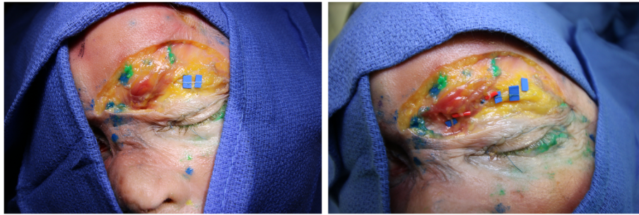
Fig. 1 Anatomic dissection. After skin excision, the corrugator muscle (CSM) is identified. The location of subcutaneous, lateral attachments of the CSM have been marked in green via a transcutaneous injection. Sensitive branches from the supraorbital and supratrochlear nerves crossing the corrugator muscle (red marks) with a vertical trajectory are identified. Motor branches, parallel to the CSM are highlighted in blue