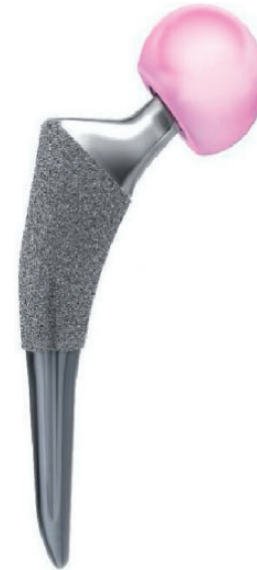
Figure 2. Tri-Lock mini stem. 11

Although ceramic on ceramic articulations do have favourable wear characteristics, there is concern regarding the potential for squeaking and the brittleness of ceramic bearings. Furthermore, there is the potential for unwanted reduction in bone density around the implanted ceramic implants, a phenomenon known as stress shielding. 8 To address these potential