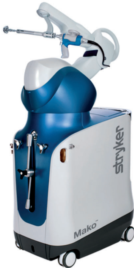
Figure 5. Stryker Mako Robotic System Chai W, et al. Use of Robotic-Arm Assisted Technique in Complex Primary Total Hip Arthroplasty. 52

(Warsaw, Indiana USA) are increasingly widely available.