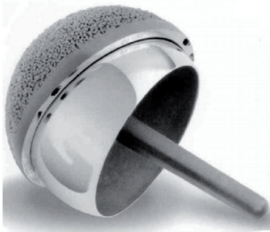
Figure 1. Metal-on-metal Birmingham Hip Resurfacing. 2

shown to offer lower dislocation rates and superior functional outcomes for younger active patients compared to conventional total hip arthroplasty. 4,5 Whilst metal on metal hip resurfacing remains an option for active males with larger hips, it is no longer considered appropriate for men with smaller femoral head sizes and never appropriate in women. Therefore, recent advances have focused on new alternative bearing couples for hip resurfacing. Novel approaches to address this issue include the use of ceramic on ceramic or metal on polyethylene articulations.