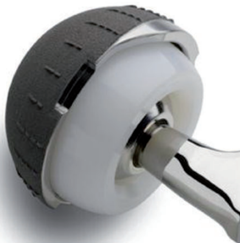
Figure 3. Dual Mobility Total hip arthroplasty. 18

One of the more promising areas in the development of knee arthroplasty implants has been in the development of cementless methods of fixation. Traditionally total knee arthroplasty prostheses have been implanted with polymethyl methacrylate cement as a grout interdigitating with the cancellous bone and the implant surface. Cementless total knee arthroplasty has the advantage of avoiding an extra interface with the