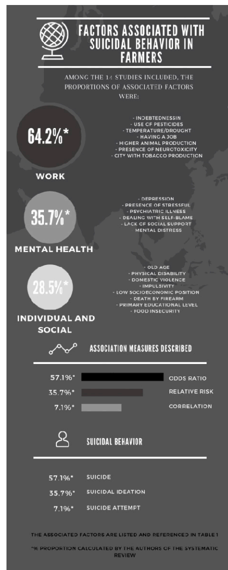
Figure 5. Factors associated with suicidal behavior in farmers. (App used: Canva Pty Ltd. [42]).