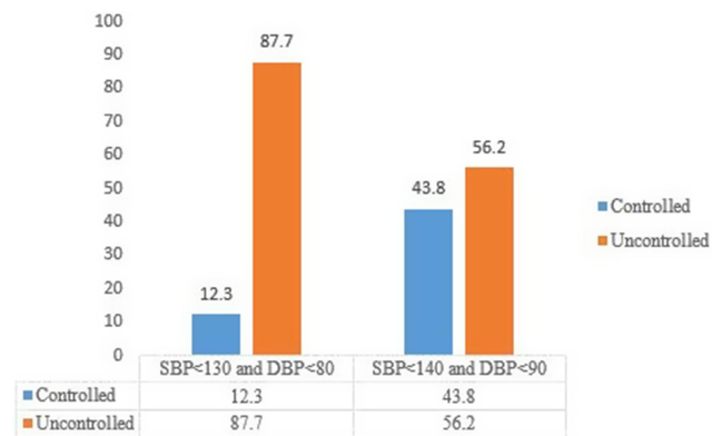
Figure 2 The level of blood pressure control <130/80 mmHg vs <140/90 mmHg for hypertension patients attending outpatient department of Dessie Referral Hospital, Dessie, Ethiopia, 2019.

From the total of 203 study participants, 102 (50.2%) were females. It was similar with that of a study done at Zewditu Memorial hospital in Addis Ababa (55.6%). 8 The same study was done in Gondar which reported that 61.9% of patients were females. 9 The mean age of patients in this study was found to be 55.2 which is almost similar with that of a study done in Gondar (57 years). 10