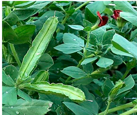
Figure 1. A Psophocarpus tetragonolobus plant.

wing, hence the name of winged bean. Each pod ranges from 15 to 30 cm in length, and it is about 3 cm in width [8].