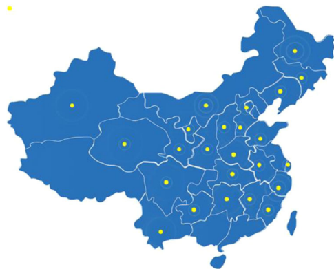
Fig. 1 Branches of CARDPC. A map indicating where the branches of CARDPC can be found.

WeChat, a social media application that is prominent in China, has played an important role in the communication and professional support during the pandemic. A WeChat social media group to provide remote guidance work of COVID-19 for 24 provinces or cities where suffered from serious outbreak was developed rapidly at the very beginning of the pandemic in China. In total, more than 200 hospital specialists in relevant fields were invited to the WeChat group, covering more than 3,300 medical professionals working in the frontline in 1300 county hospitals from 900 counties. Through this WeChat group, high-quality support and guidance from specialist was delivered quickly and efficiently to rural areas, which improved the capabilities of county hospitals and alleviated the work pressure on other facilities. By the end of February, a total of 647 clinical staff from 500 hospitals across the country participated in the