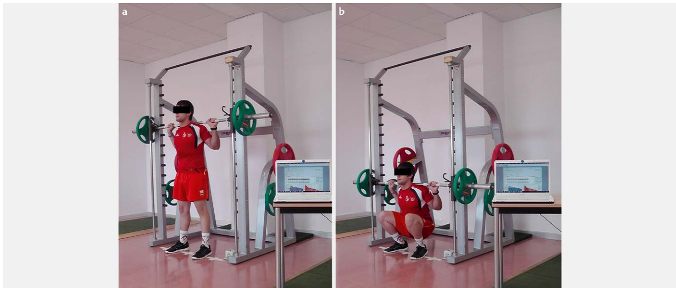
► Fig. 1 Starting a and transition from eccentric to concentric phase b positions of the full back squat performed in a Smith-type machine.

medium ( 0.70\text{--}1.15\text{ m}\cdot\text{s}^{-1} ), and only one for the heaviest ( <0.70\text{ m}\cdot\text{s}^{-1} ) loads. Inter-set rests were 3 min for the light and medium loads and 5 min for the heaviest loads. Only the best repetition at each load, according to the criterion of fastest mean propulsive velocity [36], was considered.