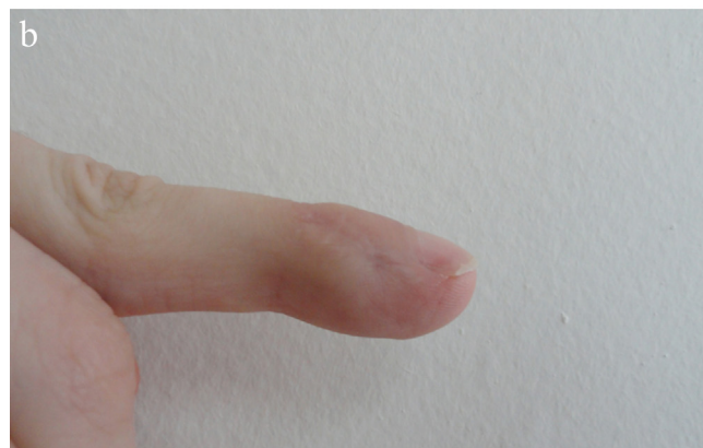
Fig. 3. Follow-up radiographs (a) and physical examination (b) at two years after surgery. Radiographs showed radiopaque interface and no evidence of local recurrence.