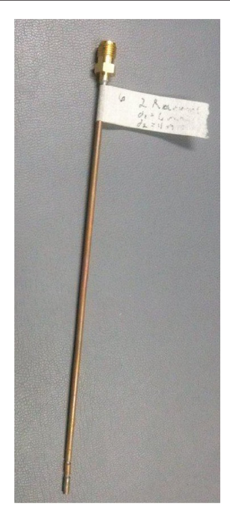
Figure I Applicator for microwave ablation.