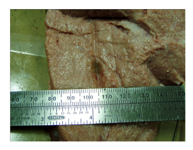
Figure 3 Ablation of breast tissue ex vivo at 2,450 MHz and 10 W.

Figure 2 Simulation of microwave applicator inserted in breast tissue.