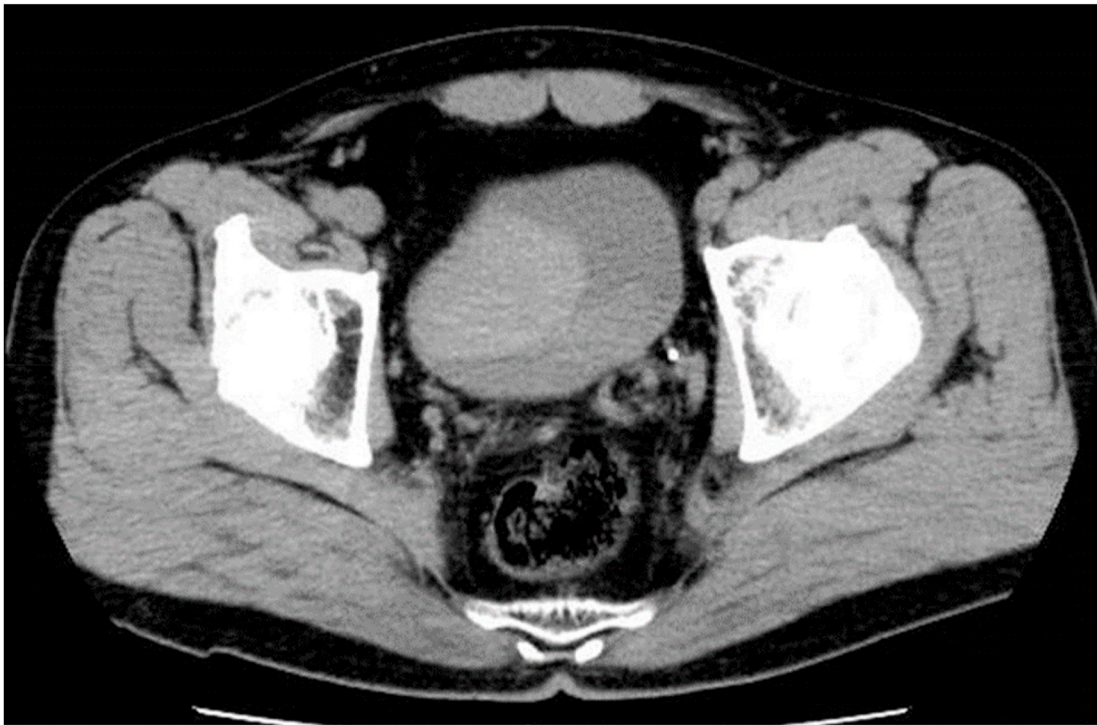
Fig. 1. Computed tomography (CT) showed a mass near the bladder right sidewall, and massive blood clots in the bladder.