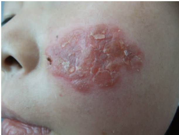
Figure 1. An erythematous plaque covered with flava eschar developed on the wound site.