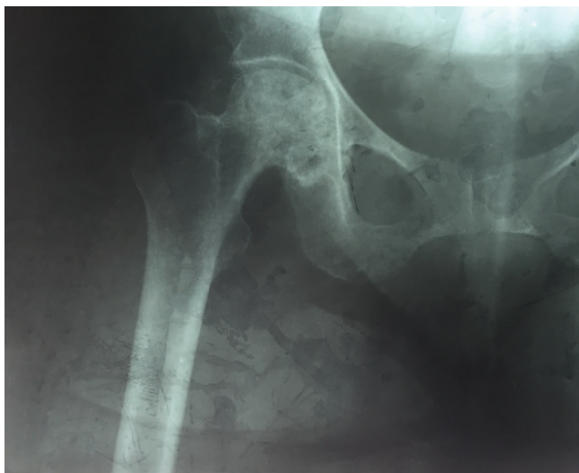
Fig. 1 Anteroposterior radiography of a 27-year-old female sickle cell patient with right femoral head avascular necrosis.

One major purpose of this literature review is to highlight questions with regard to the paucity of experimental models in the current literature that will help form the basis for research to improve osseointegration in SCD patients. With considerable prior work having been undertaken to understand the mechanism of microcellular bony hypoxia, the current review sets out to bring to the fore the need to investigate further potential in vitro experimental models which will mimic the in vivo pathologic setting in sickle cell avascular necrosis. This will lead to building blocks that could help form the foundation for research directed at improving osseointegration in sickle cell disease patients.