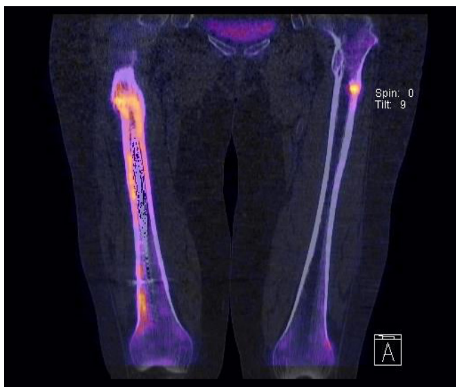
Fig. 3. Bone scan result showing focal activity of left femur consistent with stress fracture in addition to area of hypervascularity in right femur.