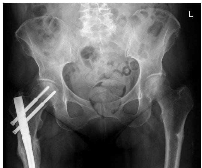
Fig. 5. Pelvis X-ray with anteroposterior view showing right femoral nailing as well as worsening of stress fracture on left femur 3 years later.