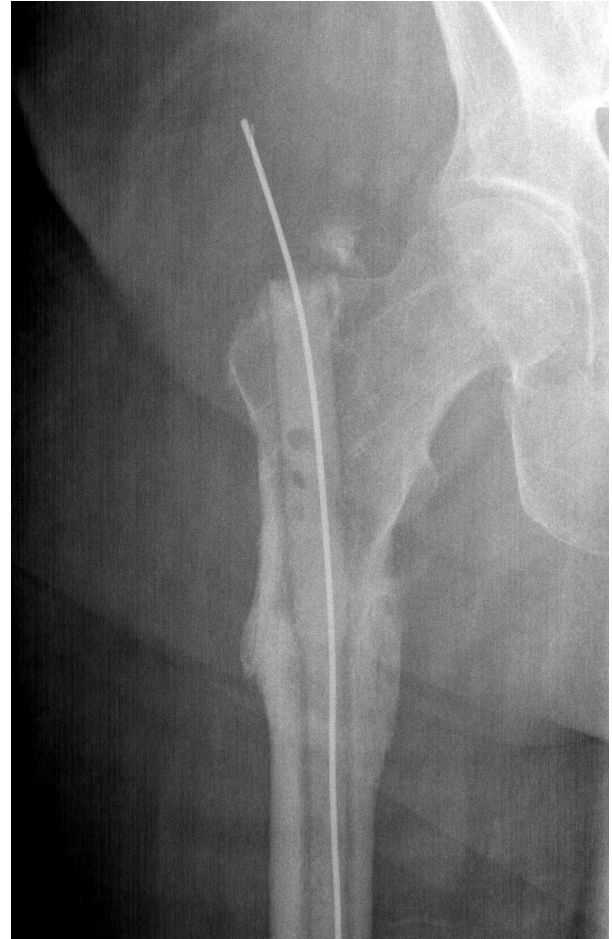
Fig. 4. X-ray of right femur with anteroposterior view showing new intramedullary nail in January 2019.

During this admission, the bone turnover indices were as follows: urine N-terminal telopeptide (NTX), 70 nmol BCE/L (reference range, 26–124 nmol BCE/mmol creatinine in premenopause); NTX/creatinine ratio, 30 nmol BCE/L (> 50 in premenopause); ionized serum calcium, 1.28 mmol/L (1.12–1.32 mmol/L); plasma phosphate, 1.15 mmol/L (0.75–1.50 mmol/L); plasma