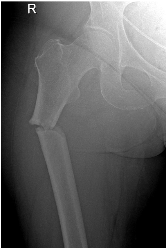
Fig. 1. X-ray of right femur with anteroposterior view showing atypical subtrochanteric fracture in February 2016.

Fracture on femoral diaphysis from distal lesser trochanter to proximal supracondylar ridge. At least 4 of 5 major criteria need to be present, none of minor criteria necessarily need to be present. ASBMR; the American Society of Bone and Mineral Research.