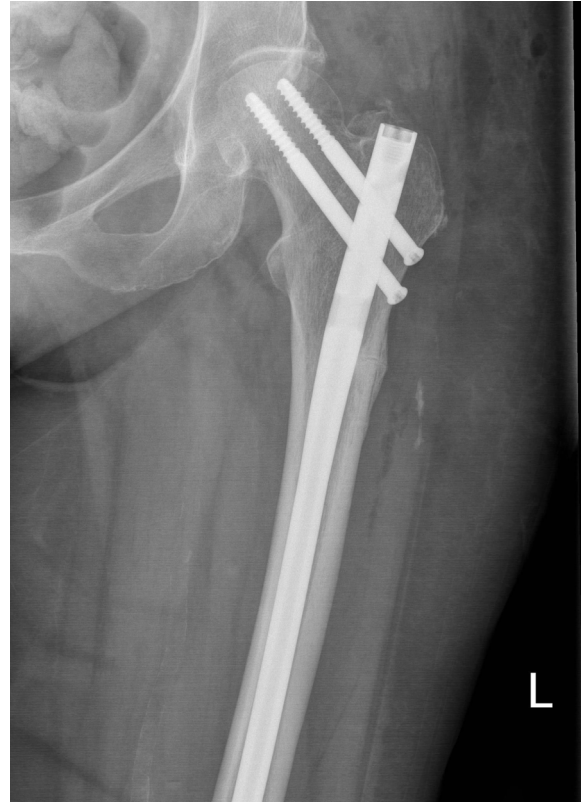
Fig. 6. Anteroposterior view of left femur radiogram after prophylactic nailing in April 2019.

A case series reported an association between intramedullary nailing and with new bone formation in cortical defects in symptomatic incomplete AFFs. 8) However, justification of prophylactic surgery in asymptomatic patients can be difficult even in the presence of bilateral disease and previous contralateral fracture. 6,7) However, anecdotal studies showed improvement without surgery