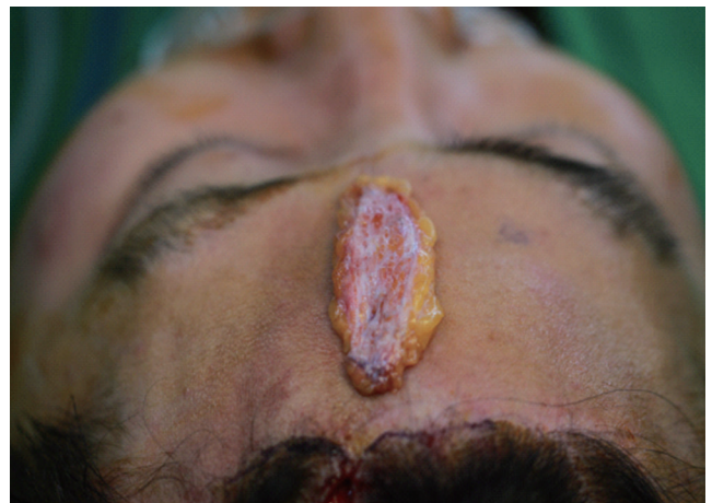
Fig. 3. Intraoperative image of the dermal fat graft.

At a follow-up visit 26 months after the surgery, the scar-like, depressed lesion and the outlines had significantly improved. The graft tissue was viable and well maintained, and patient satisfaction was quite high (Fig. 4).