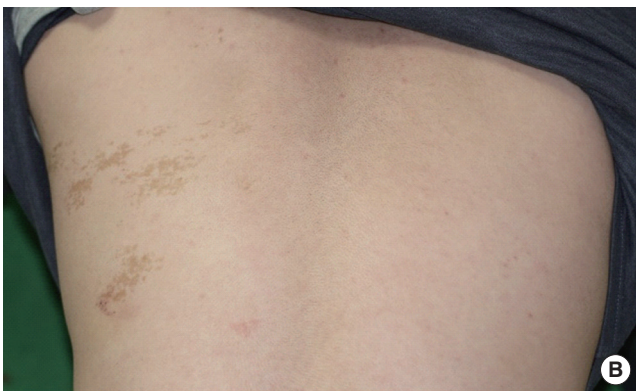
Fig. 1. Preoperative views. (A) A depressed scar on the mid-forehead region. (B) Generalized plaque morphea lesion involving the trunk.

low the periosteum and sutured to create a natural bone contour where the frontal bone defect had been. Subsequently, dermal fat graft was performed to improve the soft tissue contour. Dermal fat graft was harvested from the right inguinal area for de-epithelialization. The harvested dermal fat was placed with the dermis facing up (Fig. 3) and inserted into the pocket by pulling it through the inferior end of the lesion with a needle. The graft was then fixed to the skin superiorly and inferiorly with polypropylene sutures and removed 1 week later. Lastly, fat graft using abdominal fat was performed to improve the skin tone and create a more natural contour around the forehead defect area.