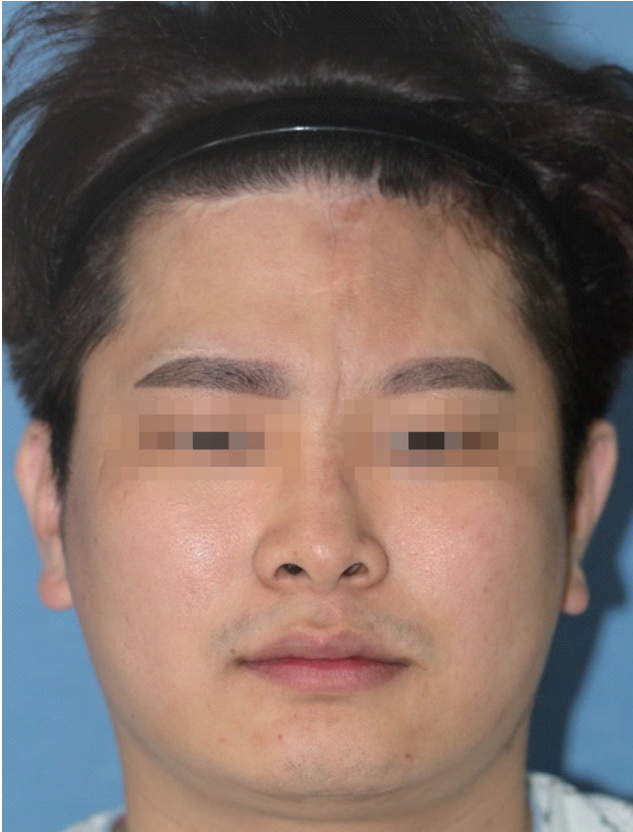
Fig. 4. At 26-month follow-up, the patient showed marked improvement.

Various treatment modalities for LScs have been introduced, such as bone graft for augmentation of the linear scleroderma at the forehead. Bone graft causes morbidity at the donor site and is limited in forming a natural appearance of the margins [4]. On the contrary, fat graft has the advantage of an autologous donor tissue, but obtaining satisfactory results is difficult in large depressed lesions. Moreover, tissue expanders provide a sufficient skin flap for closure of the defect after resection of the lesion and obtain good results. However, tissue expander takes a long time to obtain effective results, and it may be a burden to patients as it requires additional surgeries [5].