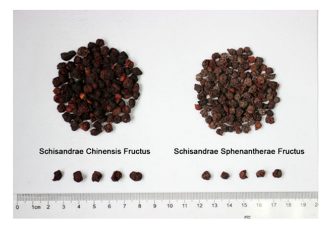
Figure 1. Samples of Schisandrae Chinensis Fructus and Schisandrae Sphenantherae Fructus collected from herbal market.

is often adulterated by Nanwuweizi in the herbal market because of their similar fruit morphologies (Figure 1) and the lower price of Nanwuweizi. To guarantee their safety and efficacy, the correct identification of Wuweizi and its Chinese patent medicines is highly desired.