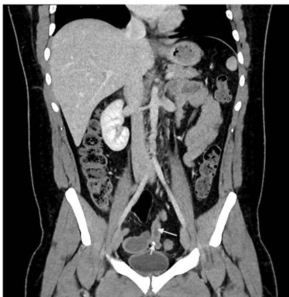
Fig. 1 CT coronal view shows chicken bone (arrow head) inside MD (arrow)

Meckel's diverticulum is the most common malformation of the GI tract and is present equally in both sexes.