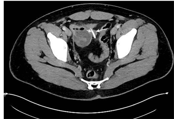
Fig. 2 CT transverse view shows chicken bone (arrow head) inside MD (arrow)

It is a true diverticulum as it has all three layers of the small intestine. Meckel's diverticulum historically follows the 'rule of twos': It is found in 2% of the population, usually 2 ft proximal to the ileocaecal valve, 2 in. in length, and more common before the age of 2 and has 2 types of heterotopic mucosa [6]. It is reported that in 55% of Meckel's diverticula, heterotopic mucosa of gastric and pancreatic tissue is present with the incidence of 60–85% and 5–16%, respectively [7].