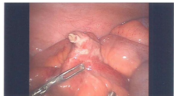
Fig. 3 Laparoscopic view of the perforated MD by chicken bone

It is reported that less than 1% of ingested foreign bodies perforate the GI tract and they are usually sharp or more than 6.5 cm [9]. Perforation of the Meckel's diverticulum is rare and reported only in 1.6% of the total GI tract perforations secondary to foreign bodies [10]. In 2009, Chan et al. reported 300 cases of perforation of Meckel's diverticulum by foreign object [6], and among them, cases of wood splinter [11], button battery [12] and chicken and fish bone [6] have been