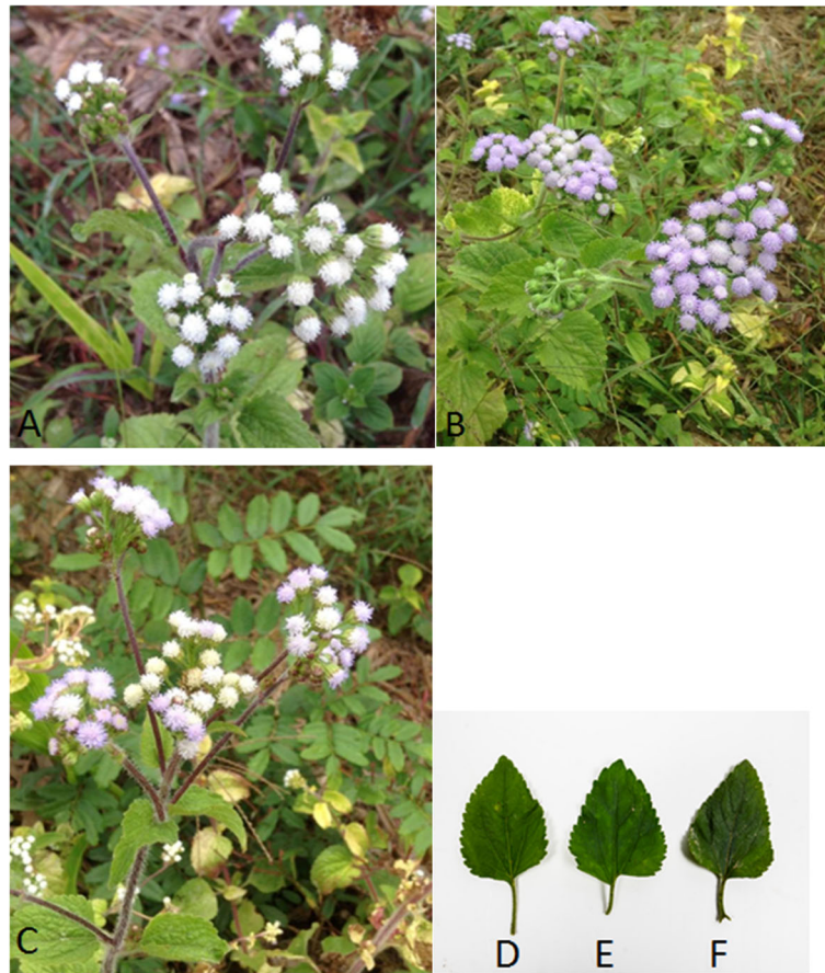
Fig. 1 Different organs of Ageratum conyzoides : flowers of white flowered (a), flowers of purple flowered (b), flowers of white–purple flowered (c), leaves of white flowered (d), leaves of purple flowered (e), and leaves of white–purple flowered (f) plants