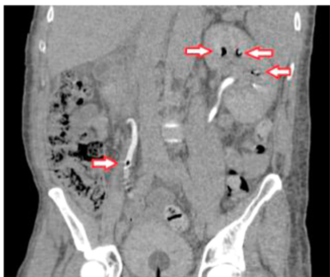
Fig. 2. Follow up CT abdomen showing air in the left collecting system and right ureter.

choice for diagnosis and follow up of emphysematous UTI is CT scan. Furthermore, Huang and Tseng et al. classify emphysematous