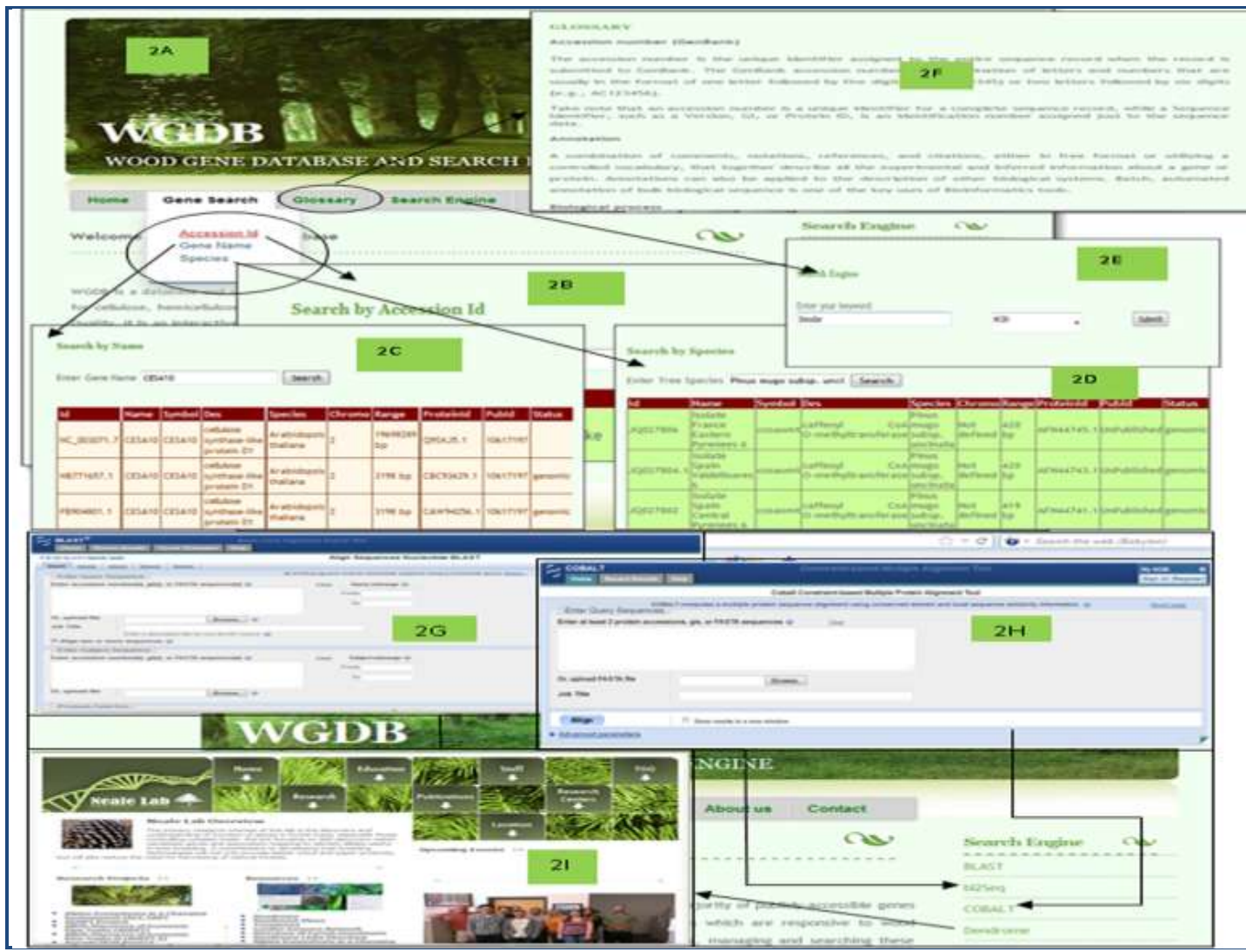
Figure 2: Snapshot of WGDB database: A) Gene search tab; B) Accession id for gene search; C) Search by Gene name; D) Search by species; E) incorporate search engine; F) Glossary tab;. G) BLAST search; H) COBALT: Multiple Sequence Alignment; I) Dendrome project.