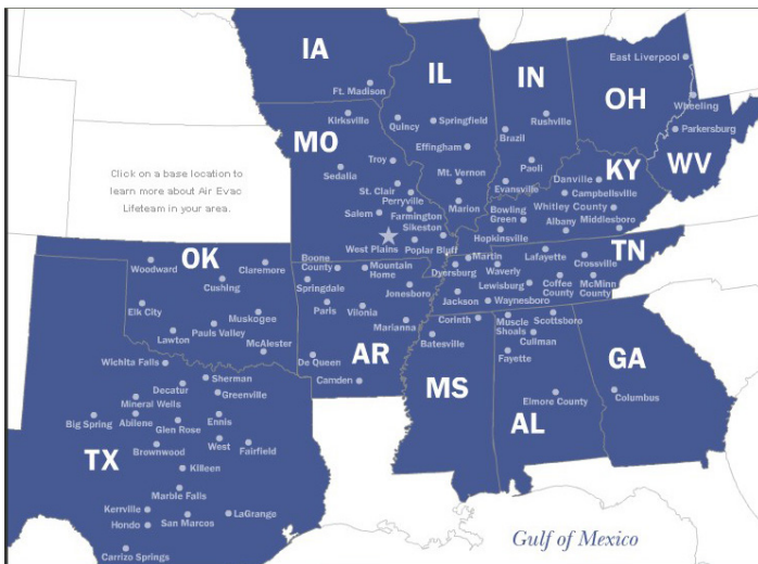
Figure 1. Coverage map for Air Evac EMS, Inc (2010).