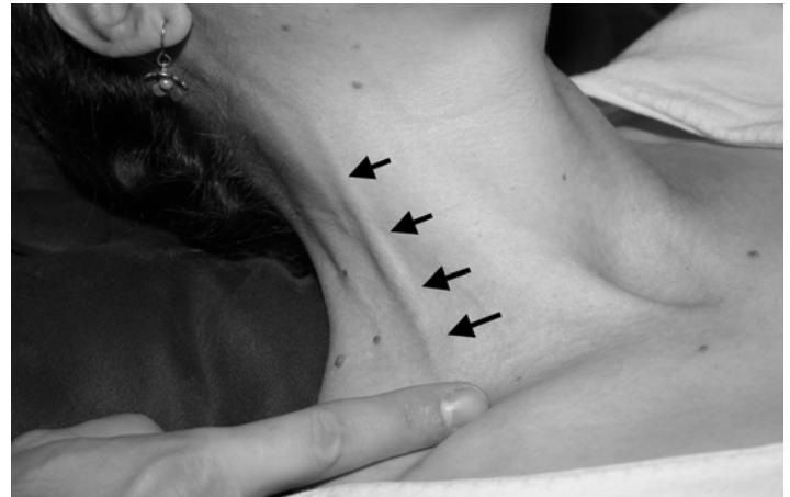
Figure 2. The external jugular vein is occluded at the clavicle and distends as it fills from above (indicated by the arrows).