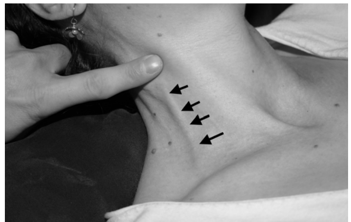
Figure 4. With the lower occlusion removed and the upper occlusion maintained, the external jugular vein fills from below, (as indicated by the arrows). The subject in the photo employed a Valsalva to stimulate a high CVP.

to partial occlusion of the vein by sclerotic valves that may prevent emptying.