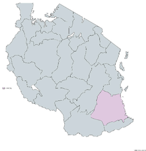
A map showing the country of Tanzania where cases of leptospirosis were identified in July 2022.

food demand, which has led to more unchecked urbanisation, agricultural, and wildlife intrusion [10]. Additionally, a disease outbreak could be delayed and contributed to by poor sanitation and clinicians ignoring disease suspicion [10].