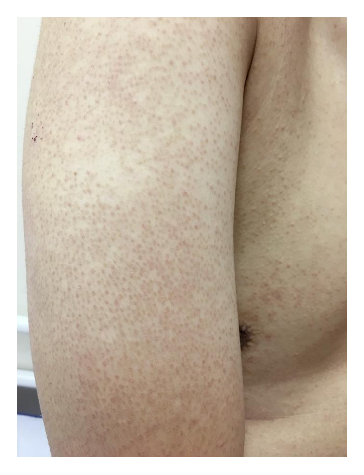
Fig. 3. Prominent papules over the posterior arm.

Leong and Aw: Nilotinib-Induced Keratosis Pilaris