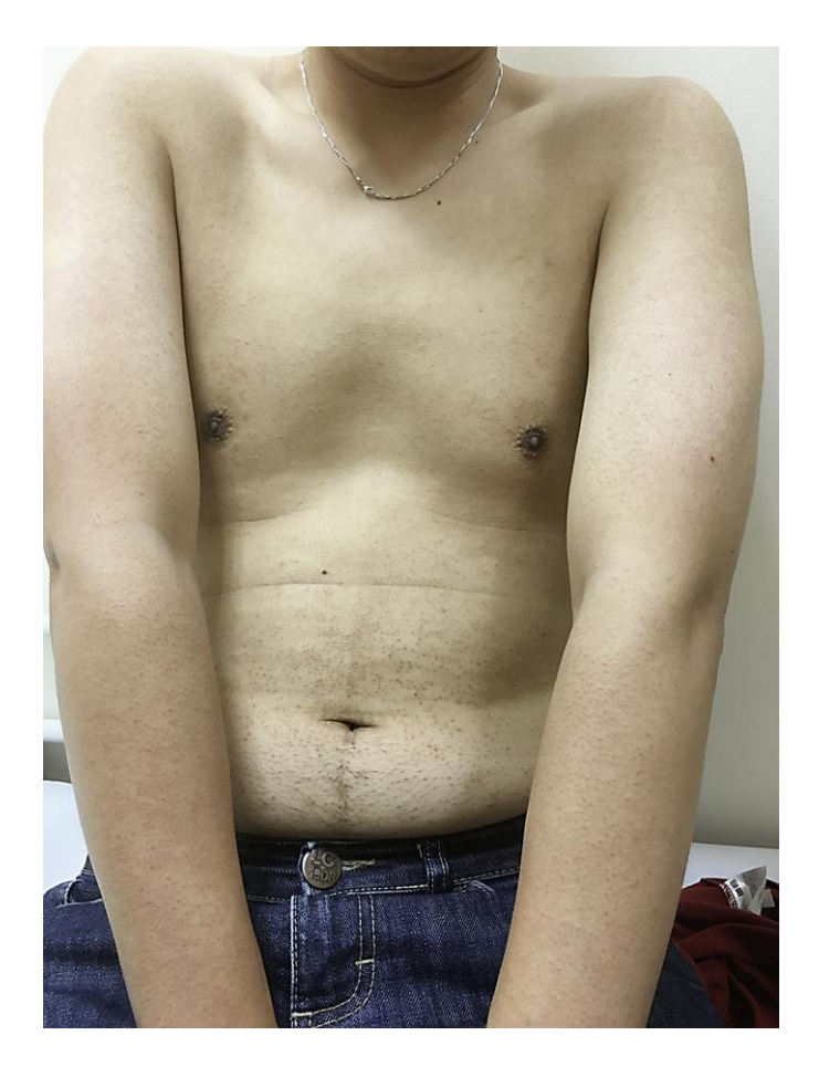
Fig. 1. Brown folliculocentric papules over the trunk and upper limbs.

Leong and Aw: Nilotinib-Induced Keratosis Pilaris