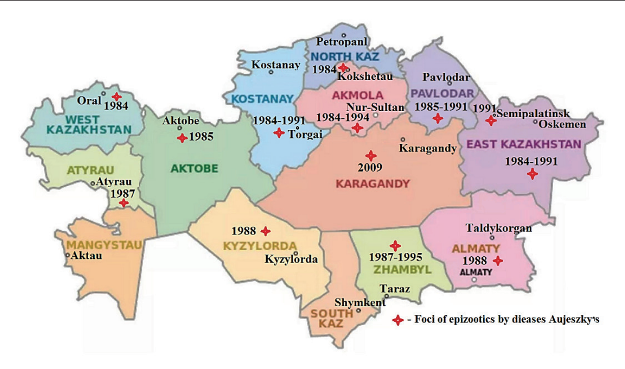
Fig. 1. Distribution of Aujeszky's disease in the territory of the Republic of Kazakhstan in the period from 1984 to 2009.

in compliance with veterinary and sanitary requirements for the prevention and elimination of infectious diseases in the Republic of Kazakhstan.