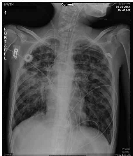
FIGURE 2: Chest X-ray on ICU admission.

Fahrenheit (F°) and her lungs exam revealed bilateral coarse crackles. Her white blood cell count was 19.0 \times 10^3 with 32% bands and her admission chest X-ray showed right perihilar alveolar infiltrates superimposed on chronic CF changes (Figure 1).