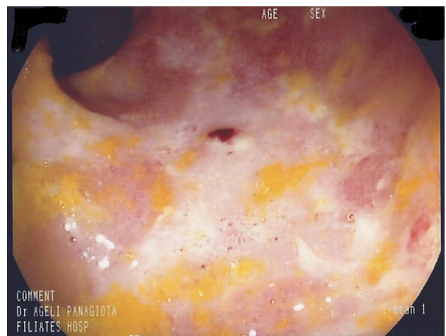
Figure 3: A month later, healing is more evident