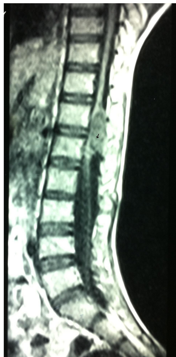
Figure 1 Sagittal T1-weighted image shows a hypointense lesion with a hyperintense signal area at the lower end (arrowhead).

The cyst was evacuated and near-total excision was done from the neuronal tissue. Some 0.5ml of thick grayish yellow pus was obtained and sent for histopathology, which revealed aggregates of keratinocytes along with keratin flakes that confirmed the diagnosis of dermoid cyst.