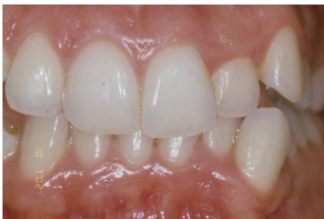
Figures 7-9. Clinical control at 1, 3 and 4 years.

for a variable time [5]. According to Andreasen, splinting may be applied within a week [3].