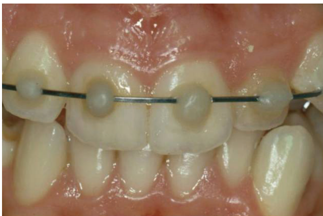
Figure 5. Clinical control at 3 months.

guidelines, a correct care plan should be performed through clinical and radiographic examinations, followed by sensibility tests and patient care instructions.