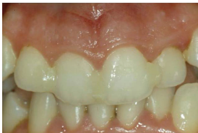
Figure 2. Reduction of crown fragments and splinted all the frontal elements with interproximal composite.

The prognosis of root fractures depends on the extent of the fracture line, the pulp tissue situation, occlusion, dislocation of fragments and the general health of the