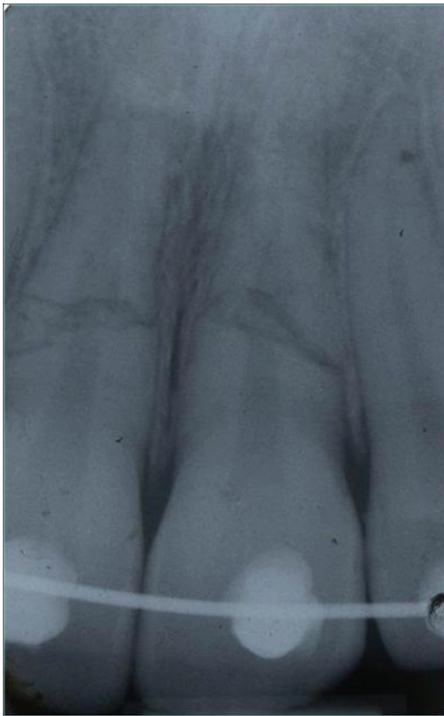
Figure 4. RX after orthodontic hard immobilization with a floss in stainless steel.