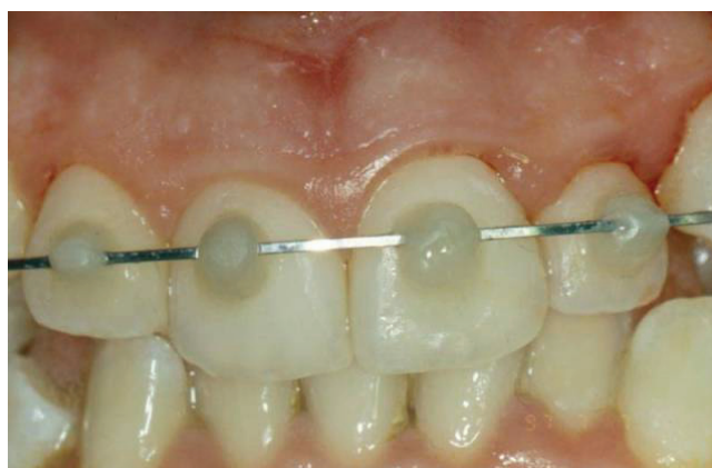
Figure 3. Orthodontic hard immobilization with a floss in stainless steel fixed diameter with photopolymeric resin.

The International Association of Dental Traumatology has recently developed a consensus statement on diagnosis and treatment of dental traumas [6]. According to these