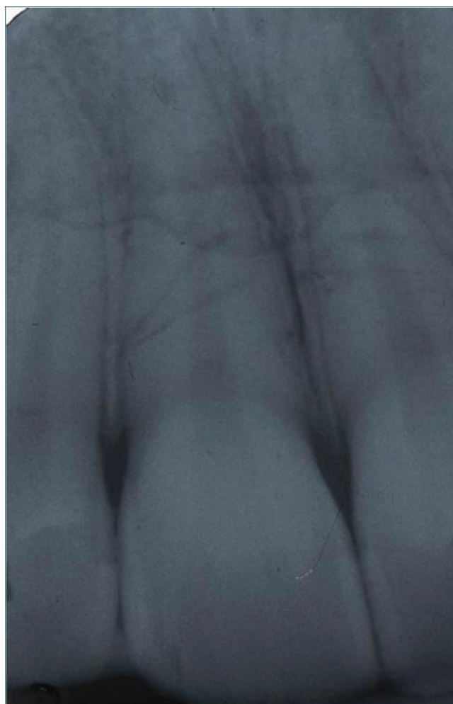
Figure 10. Radiographic control at 4 years.

Nowadays, splinting for 1-3 months is recommended, but no study on the effects of the splinting period on prognosis has been carried out yet [5,6,10]. In our case, both maxillary central incisors had severe mobility and