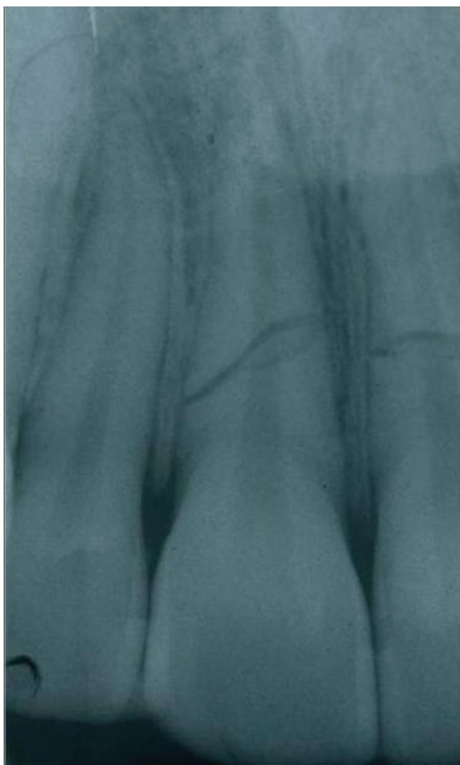
Figure 1. A horizontal root fracture was presented radiographically localized between the third middle and the third apex of the central superior incisors. The fragments appeared to be separated by a radiolucent line, and the fractured edges were rounded.

after 3 months and 1, 3 and 4 years (Figures 4-10). After the splint removal the mobility of both incisors was within normal limits and the patient reported no discomfort with his teeth and no pain during horizontal and vertical percussion tests. The electrical test responses of both central incisors were grade 4. The control check was performed on laterals and it was grade 2. No sign of pathology was visible on the radiograms.