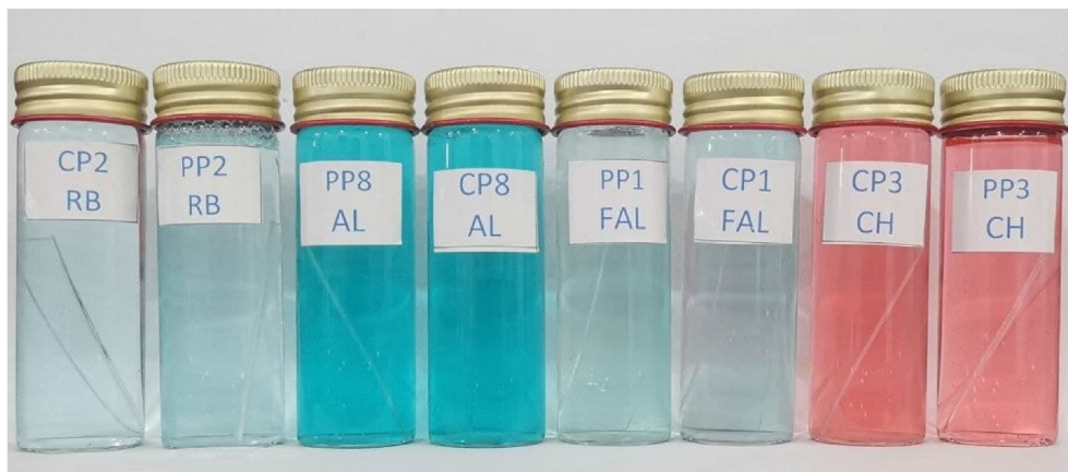
Figure 3: Sample storage. CP: Copolyester. PP: Polypropylene. AR: As received. AS: Artificial saliva. CH: Chlorhexidine mouthwash. AL: Alcohol-based mouthwash. FAL: Free-alcohol.