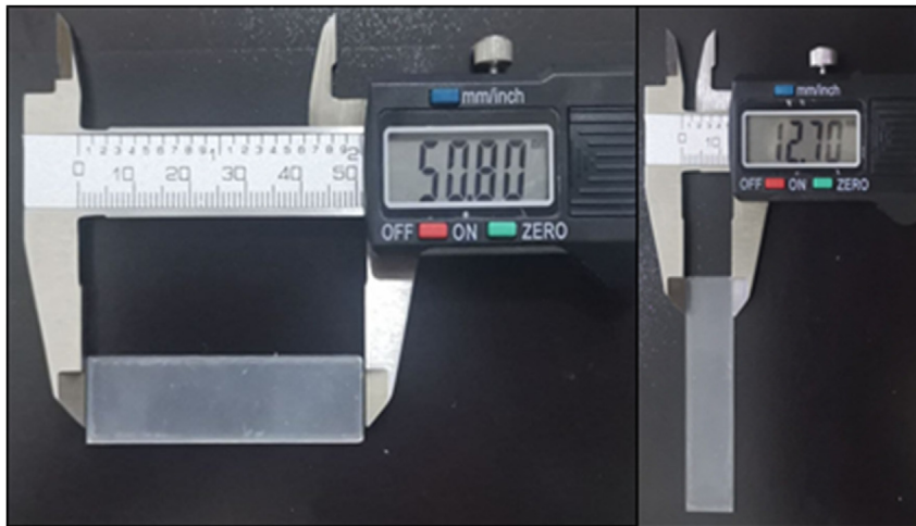
Figure 2: Thermoformed plastic material after being cut to the required dimensions.

immersion, each sample was rinsed with distilled water and stored in AS at 37 °C. All specimens were then subjected to tests for flexural modulus and light transmittance (T%).