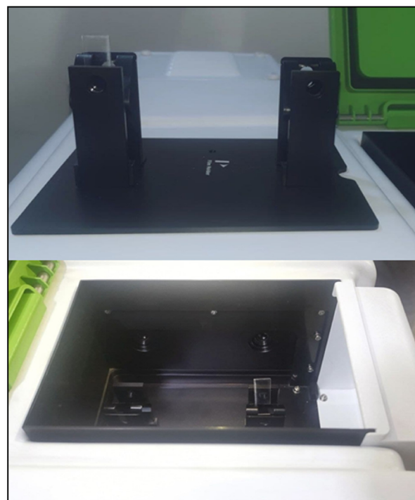
Figure 5: Color measurement test.