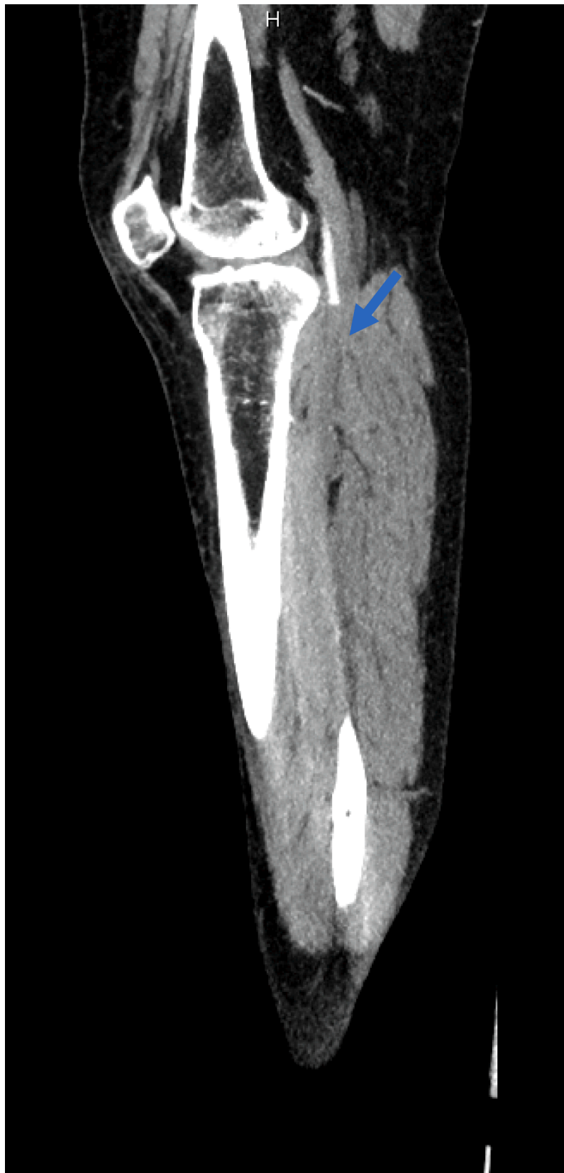
Fig. 1. (continued).

clearly understood. In analyzing the case at hand, we noticed a delay in timely diagnosis as the patient presented to the emergency department three separate times with worsening pain. High clinical suspicion for