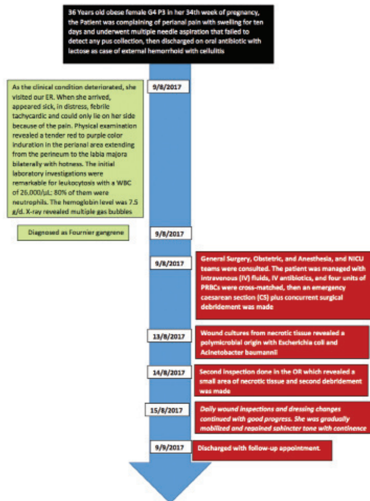
Figure 1 - Timeline summarizing the case presentation and the sequence of interventions.

Therapeutic interventions. In the ER, she was managed with intravenous (IV) fluids, 1 g IV ceftriaxone, 1g IV vancomycin, 500mg IV metronidazole, and 4 units of PRBCs were cross matched. General surgery, obstetric, anesthesia, and NICU teams were consulted for multi-aspect evaluation and shearing the decision regarding the emergency cesarean (CS) section with concurrent surgical debridement and subsequently