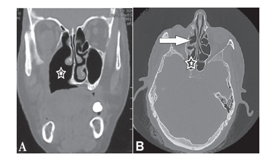
Figure 5 - An image showing: A) removal of inferior turbinate as it appears in the coronal cut (star), and B) axial CT showing clear ethmoid (arrow) and sphenoid sinuses (star).

Discussion. Mucormycosis is an uncommon fulminating fungal infection which is aggressive and has a fatal outcome if untreated. This infection is caused by many genera of saprophytic fungi related to phycomycetes (zygomycetes) and order Mucorales . The most common species are Rhizopus , Absidia and Mucor .<sup>7</sup> Mucormycosis is abundant in soil and moldy organic materials.<sup>1,2,4,5</sup> It affects immunocompromised patients specially uncontrolled diabetics, which is the most common predisposing factor especially when it is combined with ketoacidosis, where ketone bodies displace the iron bound to serum proteins thus increasing free iron in serum, which permits growth of fungi, also due to decreased neutrophil chemotaxis and phagocytosis in the patients with diabetic