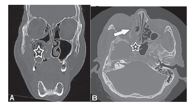
Figure 2 - A coronal CT scan showing: A) sequestration of the right maxilla and clouding of maxillary air sinus (star), and B) axial CT showing opacification of the right ethmoid (arrow) and right sphenoid air sinuses (star).