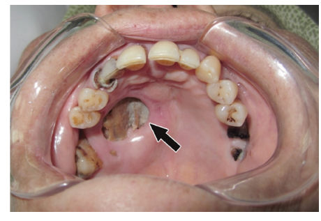
Figure 1 - An image showing the palatal necrotic bone in a diabetic female patient with rhino-orbital mucormycosis.

and short acting insulin therapy for tight glycemic control, intravenous administration of Amphotericin B (AmB) 1 mg/kg/day with daily monitoring of the kidney functions, IV ampicillin/sulbactam 1g/0.5 g twice daily, IV Diclofenac sodium 150 mg/day, and IV Ranitidine 100 mg/day. Postoperative care included local irrigation with normal saline and local packing of a piece of gauze soaked in 1 vial of AmB 50 mg twice daily. Histopathology confirmed mucormycosis, microscopic slides stained with Hematoxylin and Eosin showed clusters of spores and hyphae with right angle branching and evidence of sinonasal mucosa and bone necrosis (Figure 4). Twenty dives of hyperbaric oxygen therapy (HBO) under pressure of 2 atmosphere (ATA) with 100% oxygen saturation were given immediate postoperatively, and she showed signs of clinical improvement. The postoperative laboratory investigations revealed evidence of impaired kidney functions where BUN and serum creatinine increased gradually after 4 days; BUN was 81 mg/dl and serum creatinine was 2.0 mg/dl, yet the decision was to continue the medications, and the follow up labs were stable. The AmB was administered for a total of 20 days. Improvement was noticed during treatment