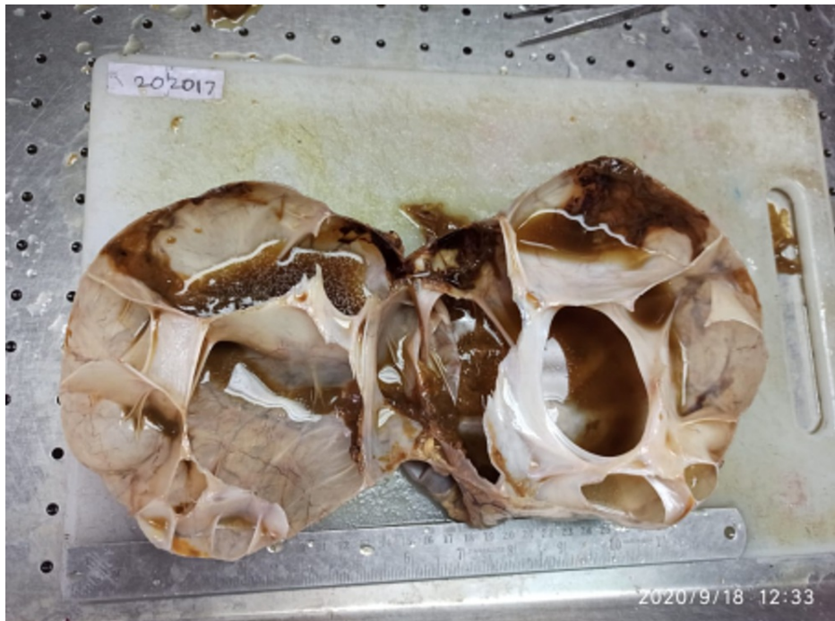
FIGURE 4: Cut specimen

On cutting open, the cyst exuded a greenish-yellow fluid (Figure 4). At the location of the cut, the lesion appeared multiloculated. The inner surface appeared smooth, and no solid areas were identified. Mucous was identified in certain places. Cyst walls were whitish and thin.