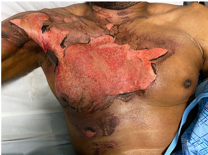
Image 1. Partial-thickness burn of the anterior chest wall in the patient prior to receiving bilateral serratus anterior plane blocks for pain.

A 72-year-old male with diabetic polyneuropathy presented to the ED with a chief complaint of chest pain two days after sustaining a flame burn while cooking. His vital signs were stable and his physical exam revealed a deep partial-thickness burn over the majority of his right pectoralis extending across midline to the left sternal border (Image 1). The patient reported severe thoracic pain (10/10) unrelieved with oral therapy consisting of NSAIDs and acetaminophen at home.