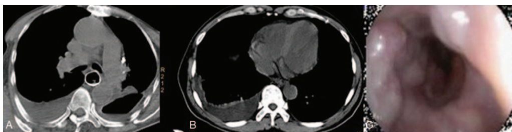
Figure 3. (A) CT image of the thorax showing a self-expandable metallic stent. (B) CT images showing complete closure of the esophagopleural fistula after stent removal. (C) Endoscopy images showing complete closure of the esophagopleural fistula 6 months later.

The early Symptoms of EPF were variable and atypical, and the misdiagnosis rate was usually high. To our knowledge, 36 cases