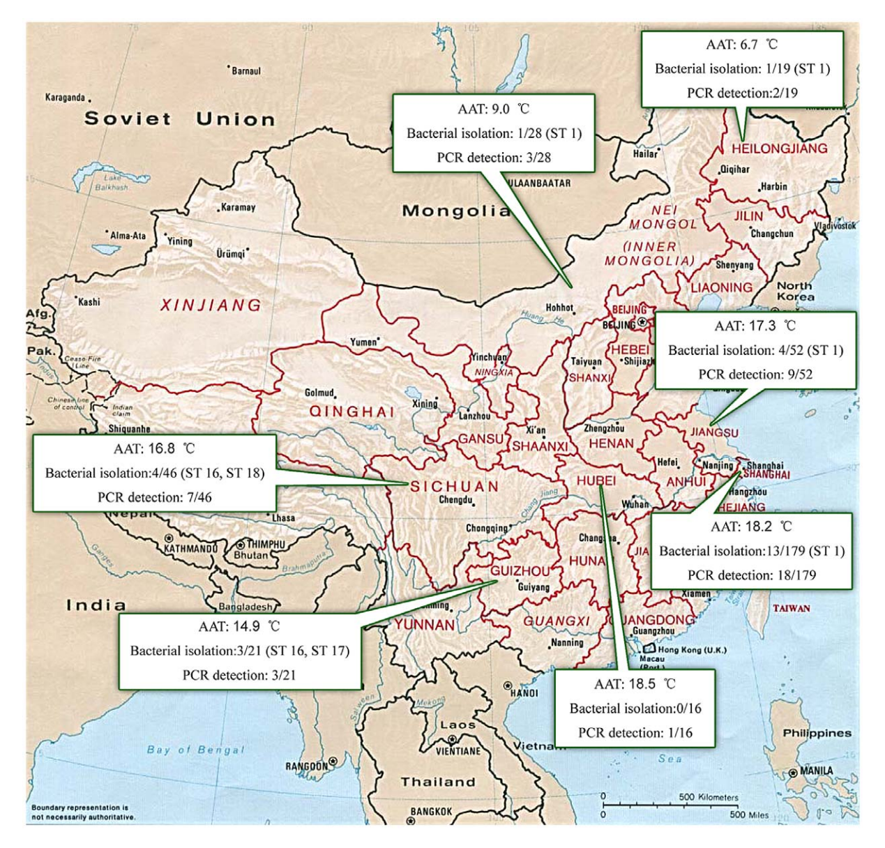
Figure 1. Geographic location of tested cats. The results of infection prevalence and the STs of isolates are specified. AAT means the average annual temperature.