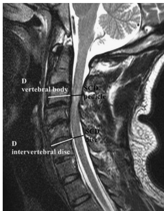
Fig. 1 Radiologic evaluation on T2-weighted midsagittal magnetic resonance imaging. Spinal canal diameter (SCD) was measured at each pedicle ( SCD_{pedicle} ) and intervertebral disk level ( SCD_{disk} ). After measuring the anteroposterior diameter of the vertebral body ( D_{vertebral\ body} ) and the diameter of the intervertebral disk ( D_{intervertebral\ disk} ), the SCD_{pedicle} -to- D_{vertebral\ body} and SCD_{disk} -to- D_{intervertebral\ disk} ratios were calculated.

For each member of the SCI group, an initial preoperative MRI was obtained within 48 hours following trauma. On T2-weighted midsagittal MRI, the spinal canal diameters (SCDs) at the C3–C7 pedicle levels ( SCD_{pedicle} ) and the C2–C3 to C6–C7 intervertebral disk levels ( SCD_{disk} ) were measured in both groups (→Fig. 1). Additionally, for both groups, the anteroposterior vertebral body diameter ( D_{vertebral\ body} ) and the intervertebral disk diameter ( D_{intervertebral\ disk} ) were measured on MRI at each pedicle and intervertebral disk level. The SCD_{pedicle} -to- D_{vertebral\ body} and SCD_{disk} -to- D_{intervertebral\ disk} ratios were calculated at each pedicle and intervertebral disk level. In addition, the extent