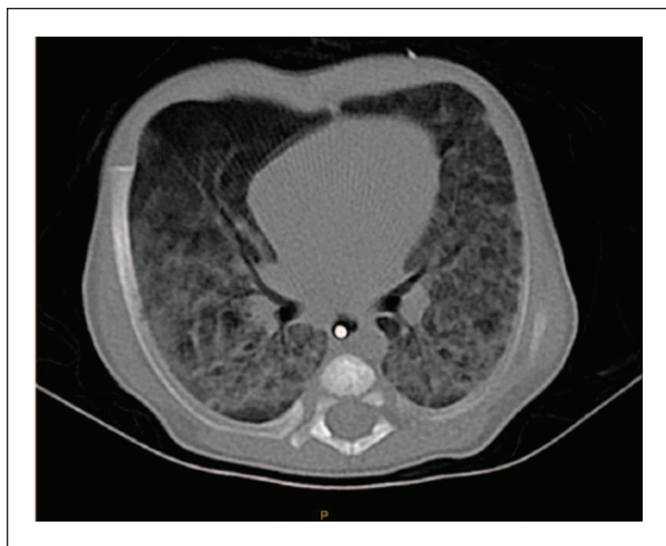
Figure 1. Chest computed tomography shows diffuse ground-glass and paraseptal thickening within the bilateral lower lobes.

and genetic studies (microarray, T-cell/B-cell clonality by polymerase chain reaction) were all normal.