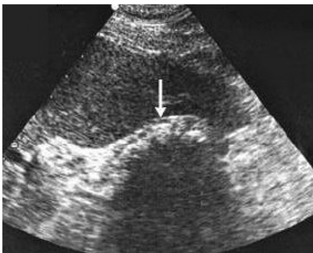
Fig. 1. Ultrasound shows a constricted gallbladder with the possible acoustic shadow in its projection.