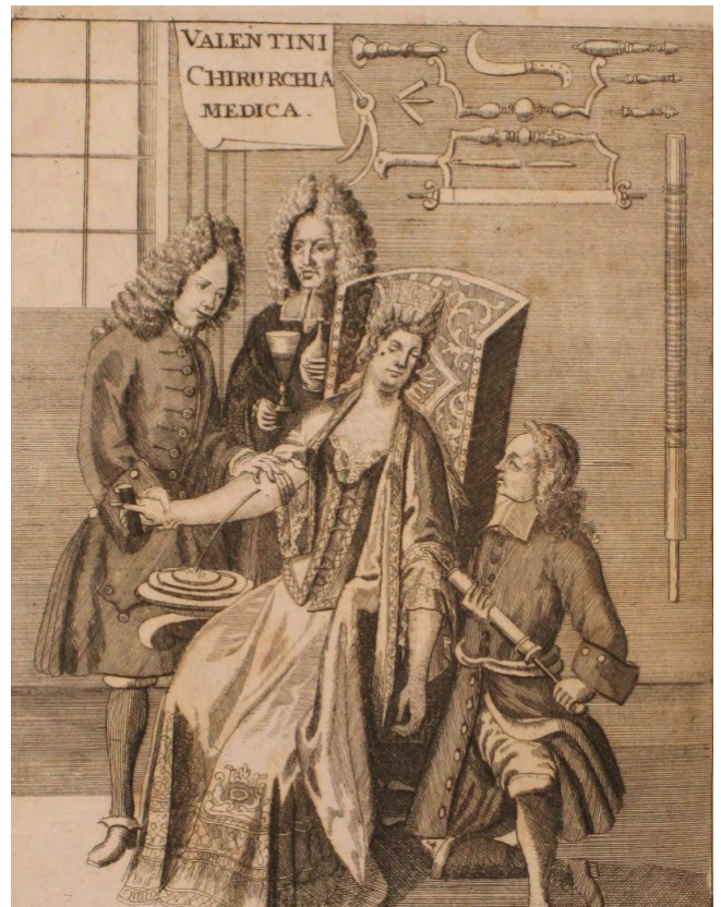
Figure 5: Bloodletting in a female patient, engraving 18 th century.

In his opinion, this type of arthritis exhibited several distinctive features; including predominance in women, a chronic course, involvement of many joints from the onset, and a decline in general health, noting "we must recognize the existence of a new form of gout, under the designation 'primary asthenic gout'". Landré-Beauvais described a new cluster of symptoms with characteristic capsular swelling, limitation of motion of the joints in the hands and fingers, a condition that may spread to other joints, and eventually development of bony ankylosis with disorganisation of many joints. He had focused in a new original approach, particularly regarding the influence of psychological factors, the need for gentle treatments, and the inappropriateness of bloodletting ( Figure 5 ); thus breaking free from the contemporary dominant doctrine of his era. 14,15