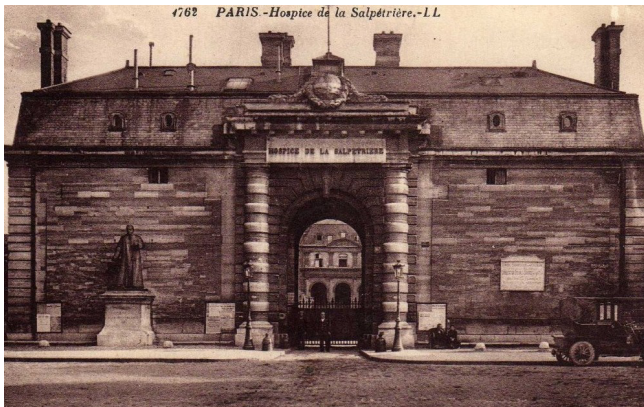
Figure 4: Salpêtrière hospice in Paris, postcard in 1762.

logue of signs written in 1809, he thoroughly presented the symptoms of a series of diseases similarly to the Hippocratic structure of Corpus Hippocraticum (5th century BC), based upon thorough observation. He had furthermore taken it for granted that anxiety will be present in infectious illnesses, influenced by Pinel's views and empathy towards patients. 11,12