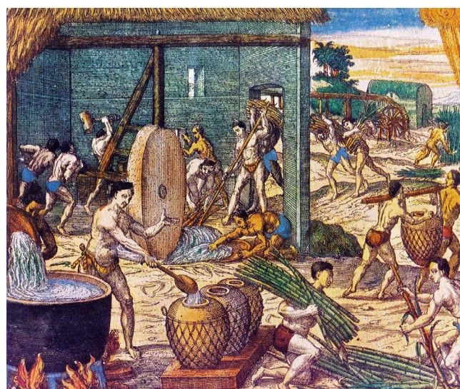
Figure 1: Caribbean sugar cane mill, coloured engraving by Theodor de Bry (1528-1598).

In the eve of the 19 th century, rheumatoid arthritis (RA) was introduced as a newly appearing disease among the general European population. A series of hypotheses concerning its prevalence were made, but most probably, sugar was to be blamed. 1-3 During that era, sugar trade between America and Europe was at its peak. The West Indian sugar trade flourished between 1755-1765 AD ( Figure 1 ). Understanding sugar’s commercial signif-