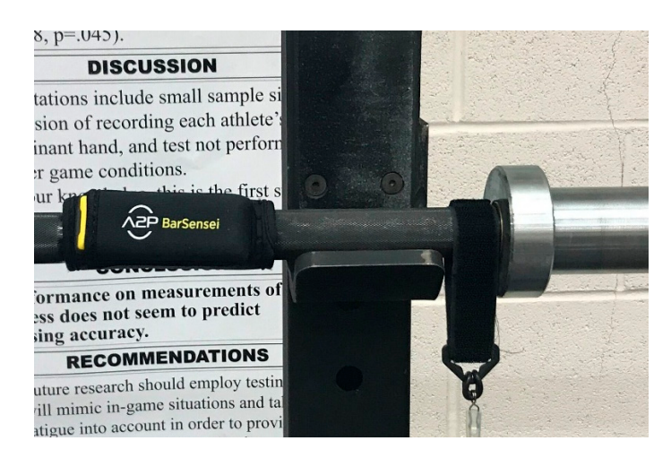
Figure 1. Placement of Bar Sensei and GymAware on a barbell.

rested for 2 min between each set. Prior to each set, subjects were reminded to control the eccentric phase and to perform the concentric phase with maximal velocity, and all repetitions were observed by an experienced strength and conditioning coach to monitor squat depth and technique. During this session, both the PowerTool and the Bar Sensei were attached to the barbell (20 kg Ohio Bar, Rogue Fitness, Columbus, OH, USA; Figure 1). For each repetition performed during this session, both MCV and PCV data were collected on each device. Subjects returned again to the lab after this testing session, 3–7 days later, to repeat this protocol.