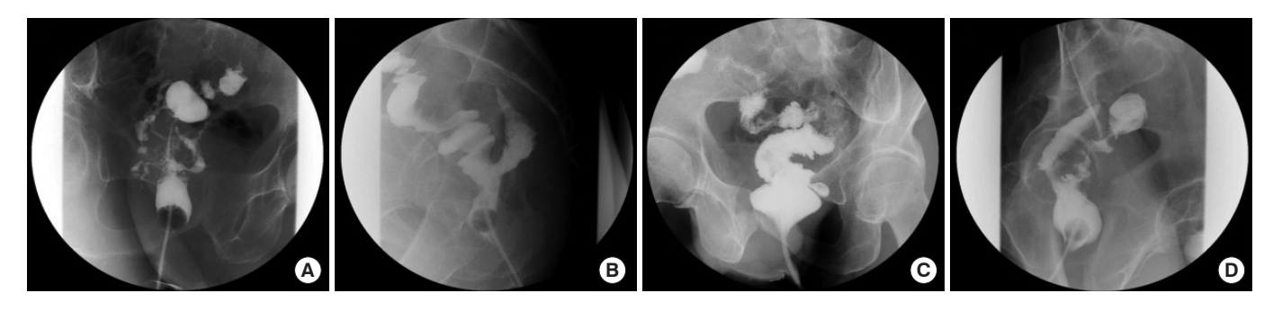
Fig. 1. Four types of radiologic leakages on a retrograde water-soluble contrast enema: (A) dendritic type, (B) horny type, (C) saccular type, and (D) serpentine type.

Table 1. Clinicopathologic characteristics of patients with clinical or radiological leakage